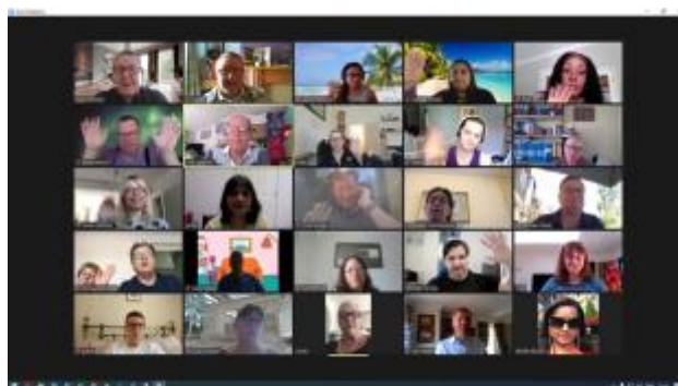
1 - A full house in the Zoom Room

Mark Masons' Hall may have 'closed for business' during the imposed lockdown, but all departments and teams are available on email to help and support.